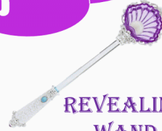
REVEALING WAND $755