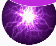
ENVIRONMENTAL MODELLING ORB $1,250