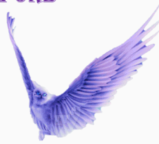
VIRTUAL DRONE $275