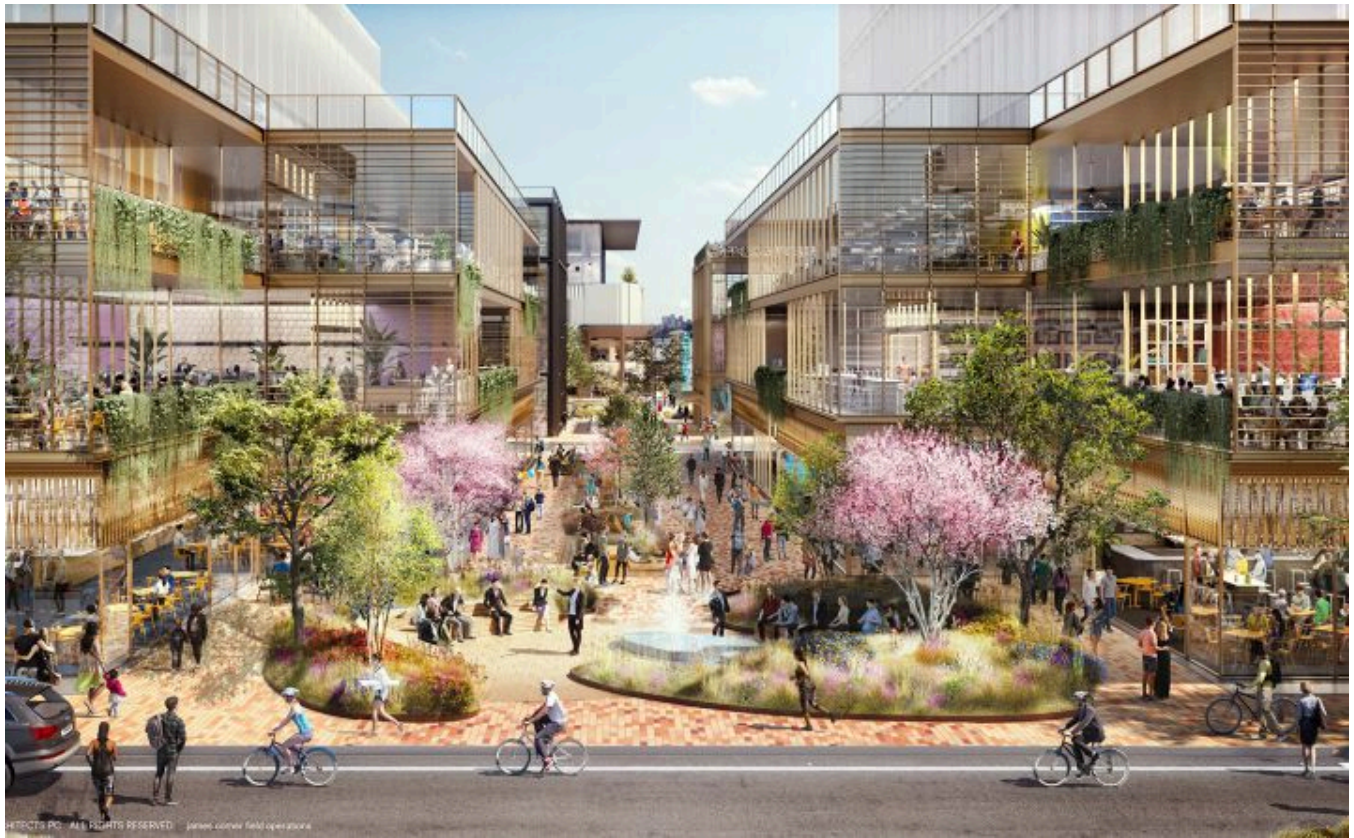
EnviroAI to Open Corporate Headquarters in Houston's New Innovation District