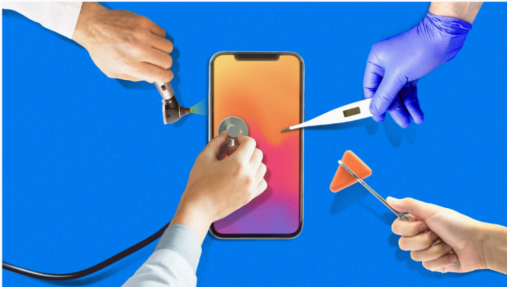
ILLUSTRATION: SAM WHEATLEY, GETTY IMAGES

Machine-learning programs are analyzing websites, news reports, and social media posts for signs of symptoms, such as fever or breathing problems.